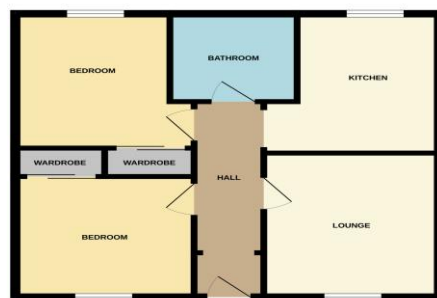
TOTAL FLOOR AREA: 51.4 sq.m. (553 sq.ft.) approx.

Services: Gas Central Heating and Double Glazing